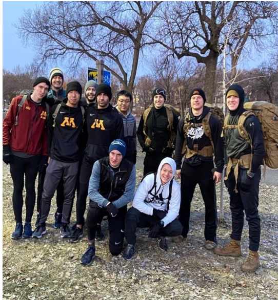
Army ROTC team with Air Force ROTC team training for Bataan

Minneapolis, MN - Every year, Cadets from the University of Minnesota compete at the Annual Bataan Memorial Death March at White Sands Missile Range, New Mexico to honor the historical event that took place in the Bataan Peninsula, April 9th, 1942. The training began in early November and was rather extensive. Cadets began with a 7 mile run and progressively trained up to 22 miles in Minnesota's brutally cold conditions to prepare for the unruly desert mountain terrain. Throughout the training process of 20 weeks, this group of Cadets ran over 360 miles. This year, due to the COVID-19 pandemic, the United States Army decided to cancel this year's Bataan Memorial Death March. This is the second time in its history the Bataan Memorial Death March was can-