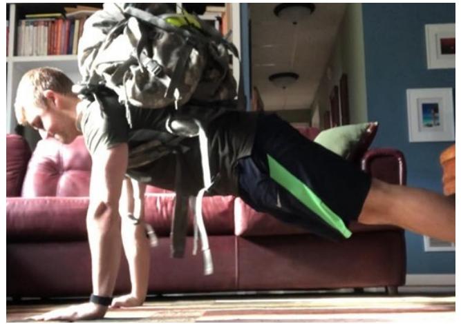
Cadet Olson doing Physical Training during COVID-19