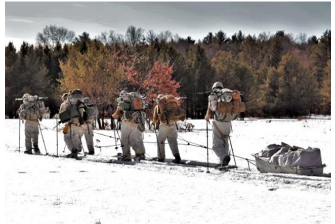
CDT Morrow using an Ahkio sled during platoon movement