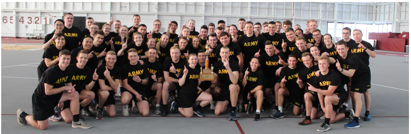
Golden Gopher Battalion celebrating their 1st Place trophy during the 2020 Joint Military Athletic Competition