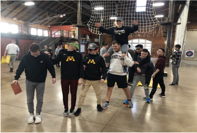
Cadets conducting an exercise activity team during a building event