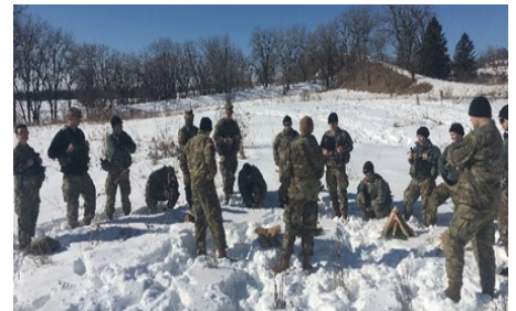
Cadets learning fire starting