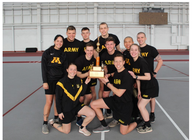
MSIVs raising the 1st Place trophy during the 2020 JMAC